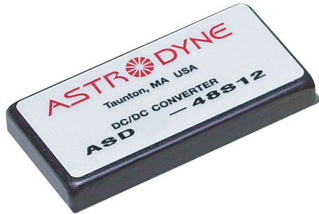
Unit measures 1"W x 2"L x 0.25"H